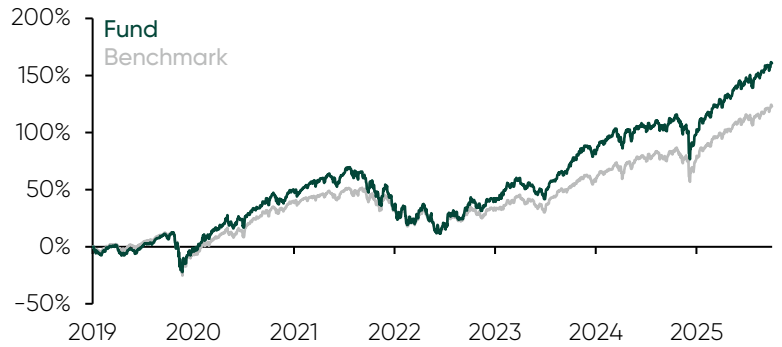
Cumulative Performance Since Inception