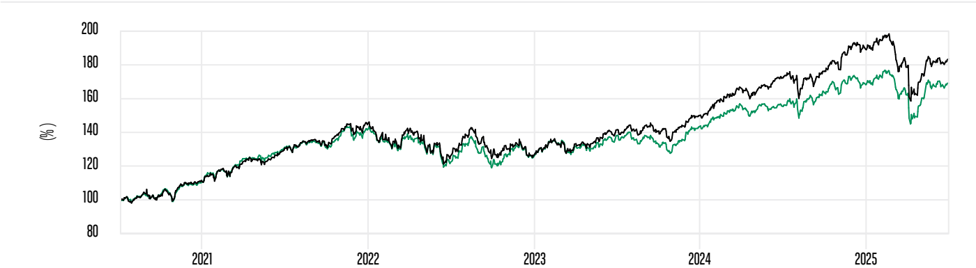
Cumulated Performance at 30.06.2025 (%)

(1) All figures net of fees (in EUR). (2) Based on 360 days